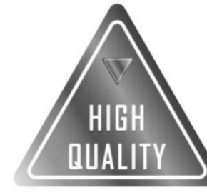
Strong and Sturdy

Built-in reinforcing ribs. Professional welding skills towards the different bearing positions. Steel plate chamfering bevels before welding.