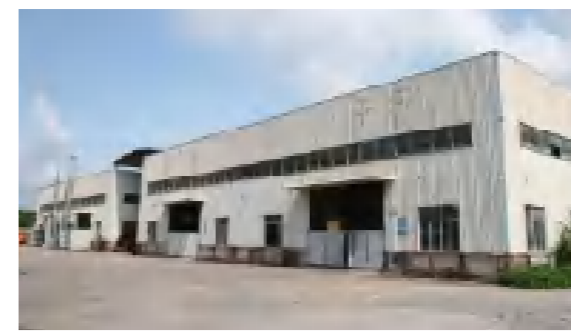
14000m 2 Workshop

We have more than 14000m 2 steel structure standard workshops with a large number of high precision processing equipment.