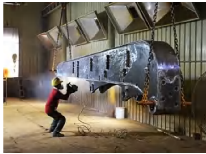
Environmentally friendly spray booth