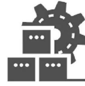
Prompt Lead Time

We use precision drawing software to achieve the max working range under the premise of safe operation.