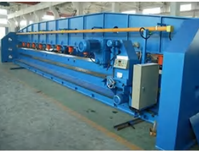
Automatic edge milling machine