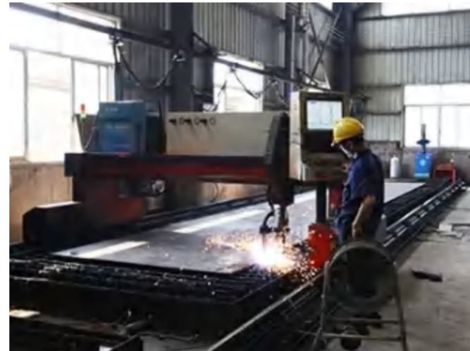
CNC plasma cutting machine