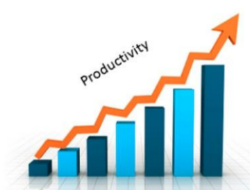
High effective and save fuel

Max work range and the max digging height are larger as angle of long reach boom arm can reach 163 degrees.