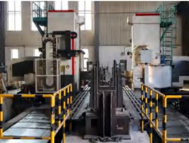
Large double-sided floor boring machine

To sum up, every single ZHONGHE product has passed the above three-stage inspection system to ensure that is qualified before shipping.